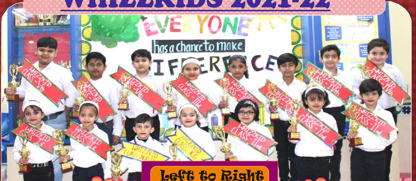
Left to Right