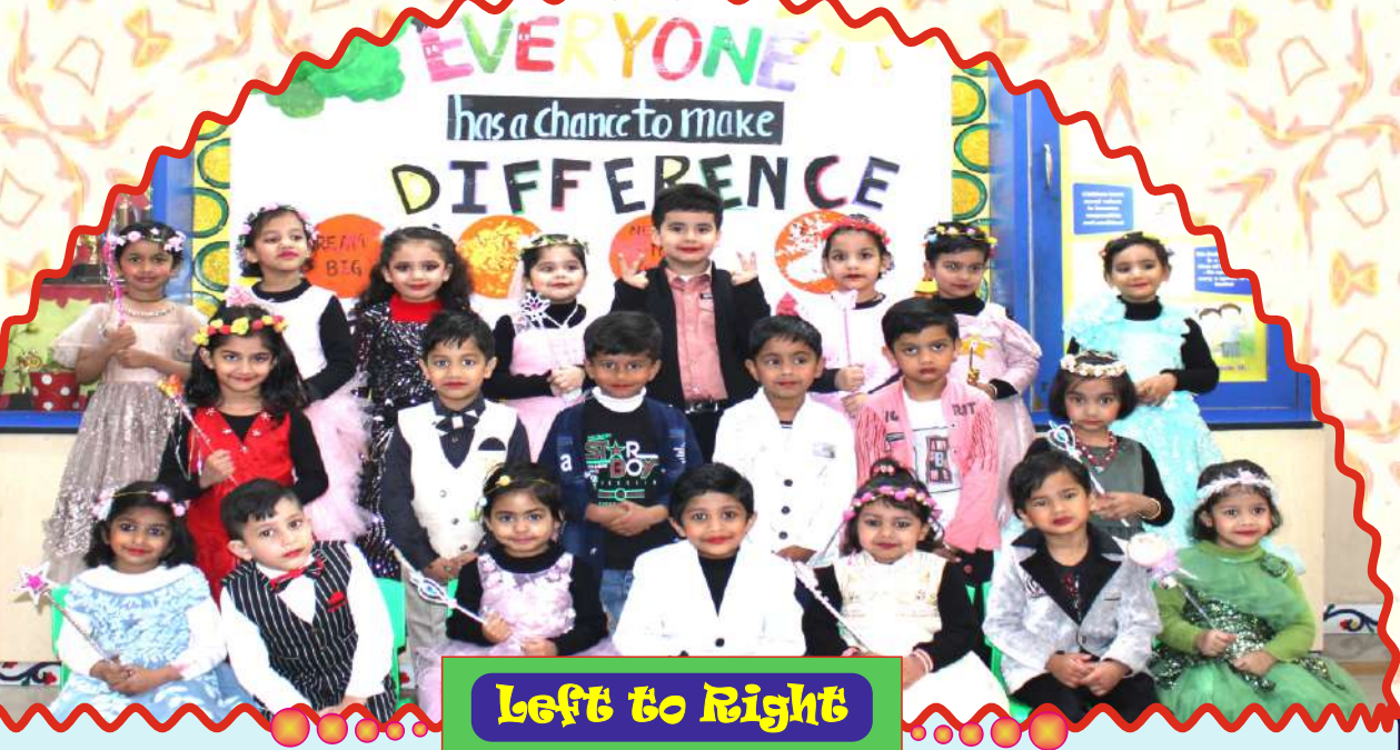
Left to Right