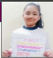
English Poem Writing Activity