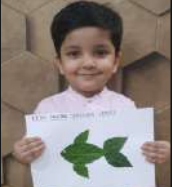
Fish Making with leaves