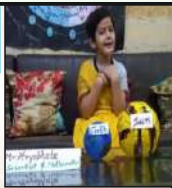
Role Play (Inventors)