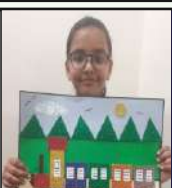
Math Project (Shapes)