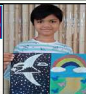
Day and Night Activity