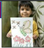
Spring Season Activity