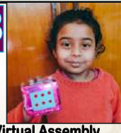
Virtual Assembly of Class KG Math Activity