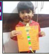
Ordinal Numbers Activity Hindi Poem Activity