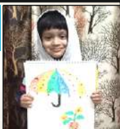
Webinar (Fitness Mantra) Bindi Pasting Activity