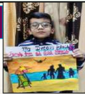
English Activity (Declamation) EVS Activity (Shapes of Moon)