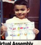
Virtual Assembly of Class I Homophones Quiz