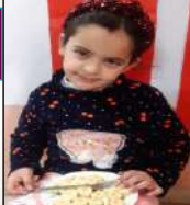
Healthy Eating Activity