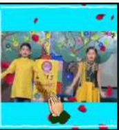
Virtual Assembly of Class II