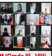
P.T.M (Grade III - VIII) Webinar (Parents & Teachers are like God)