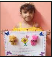
English Activity (Creative Writing)