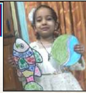
Living and Non-Living Activity