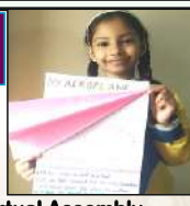
Virtual Assembly of Class Nursery Aeroplane Making