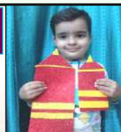
Tall-Short Concept Star of the Month