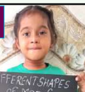
DIFFERENT SHAPES OF MOON