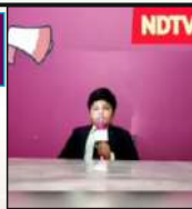
Virtual Assembly of Class III